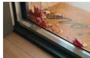
CAPTURED MESH on the top and bottom tracks