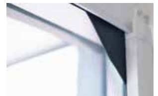
REINFORCED MESH CORNERS for added stability and durability