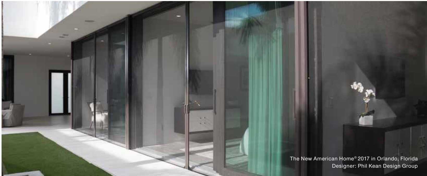
The New American Home® 2017 in Orlando, Florida Designer: Phil Kean Design Group