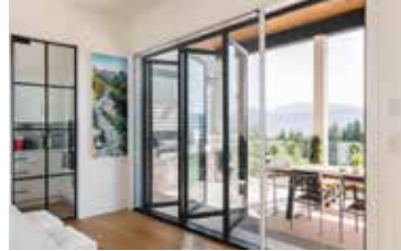
Folding Glass Walls