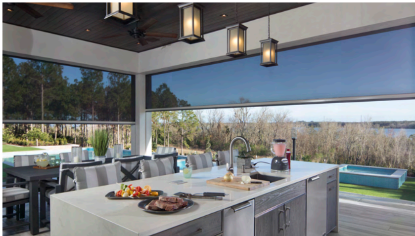
The New American Home 2018 - Orlando, FL

Whether a Phantom Screen is installed outside of a glazed area or not, that does alter the requirement for impact protection to be placed on a glazed surface. Per Florida Building Code Section 1609.1.2 , a triggering windstorm event requires an impact protection system be placed over glazed openings when a building lies in the wind-borne debris region (unless the glazing is large missile impact rated). Since a Phantom Screen is not intended to serve as an impact protection device, it can be installed so long as the glazed openings behind it meet this code in some way. Therefore, a product approval is not required when a Phantom Screen is installed. Since it is an engineer's obligation to ensure products exposed to high wind do not become wind borne debris objects, the evaluation report serves as a safe rating of the product installed to the rated threshold to meet this obligation. the outdoors.