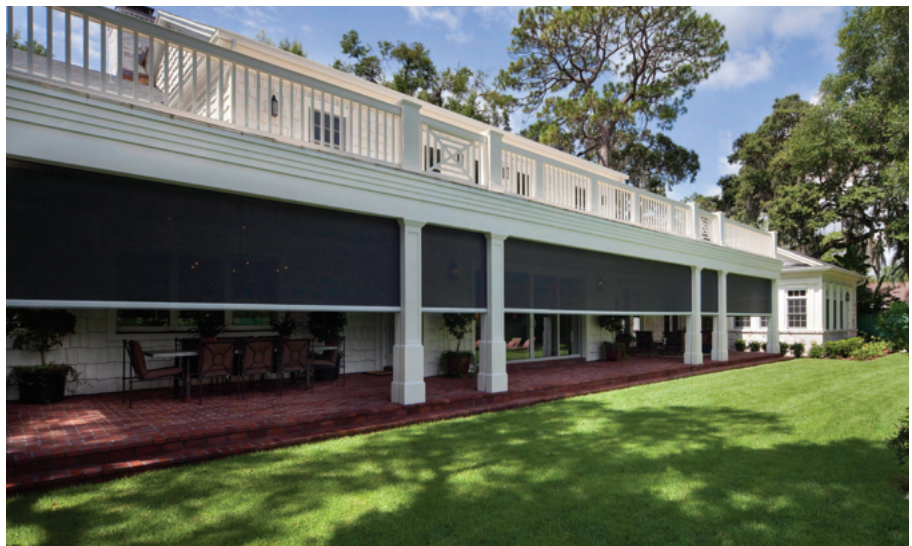
Adams Hall - Winter Park, FL