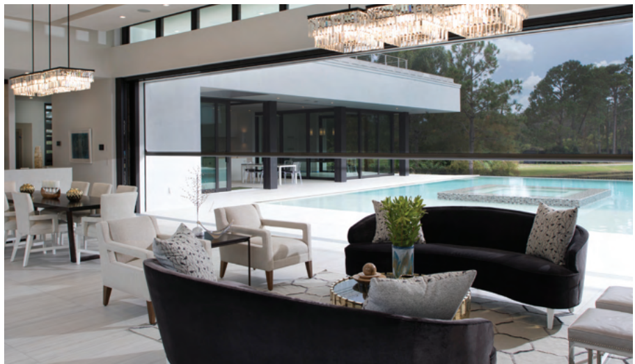
The New American Home 2017 - Orlando, FL